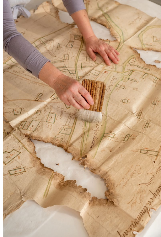
Dusting with a Chinese brush