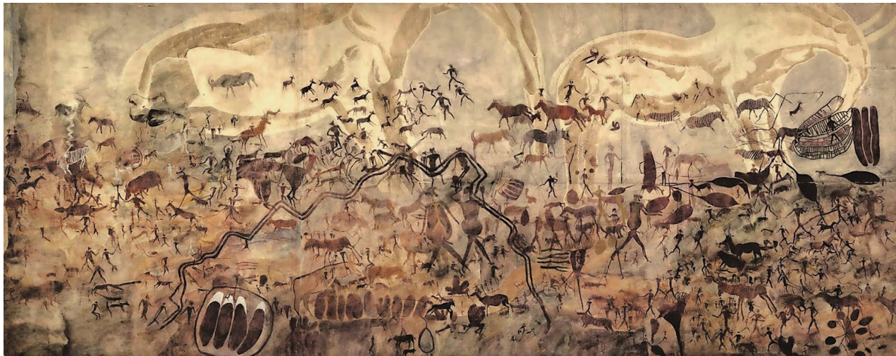
The Mutoko

The class of 2023 of the Centre de Formation de La Reliure du Limousin, a MEMORIST company, contributed, along with experts from the archaeological department of IZIKO museums of South Africa and restorers in Cape Town, to restore a copy of an emblematic cave painting entitled "The Mutoko", which will be exhibited at the Iziko South African National Gallery in May 2023.