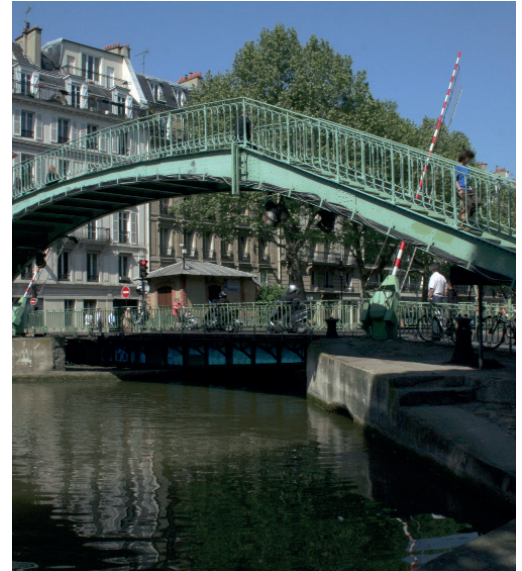
La passerelle Alibert

TRIBVN Imaging was recently asked to preserve some of the IRFA's precious historical maps. The experts digitised around sixty plans, maps and sketches of Asia, dating from the late 19th and 20th centuries.