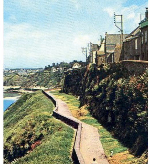
Les Remparts de Granville

French Lines & Compagnies called on Arkhênum to digitise a number of documents: notebooks in 2011, glass plates in 2013 and posters in 2021. This institution, located in Le Havre, preserves, promotes and disseminates the history of the French Merchant Navy, including the historical collections of companies such as the Confédération Générale du Travail (CGT), Messageries Maritimes and Société Nationale Maritime Corse-Méditerranée (SNCM).